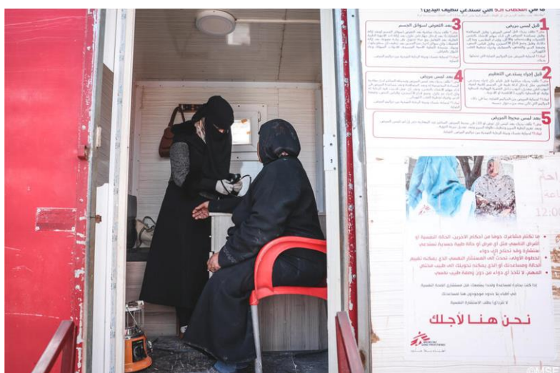
A mobile clinic in Idlib, Syria.

In Syria, MSF has been present in the North-west (NWS) and the North-east (NES) for many years, making a swift response possible in the most affected areas, mainly in NWS, since NES was much less affected. The initial response consisted in supporting medical facilities to treat patients with material and HR support, facilitating transport of patients by supporting ambulances, and providing immediate relief items to affected people. Today, MSF has scaled its efforts, deploying mobile clinics, distributing relief items, implementing water and sanitation and logistics activities, and offering psychological first aid and mental health support. In addition, MSF will support the rehabilitation of some of the affected health facilities.